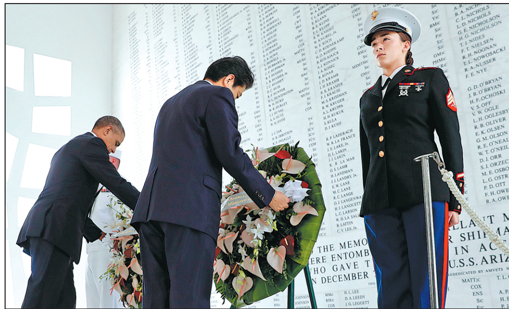
US President Barack Obama and Japanese Prime Minister Shinzo Abe lay wreaths at the USS Arizona Memorial in Hawaii on Tuesday.