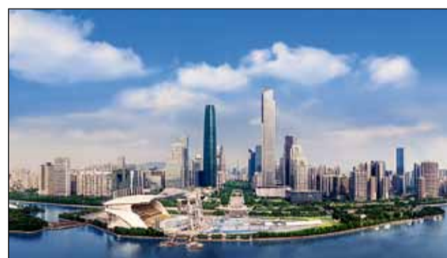
Guangzhou has hosted more than 30 international meetings over the past two years.