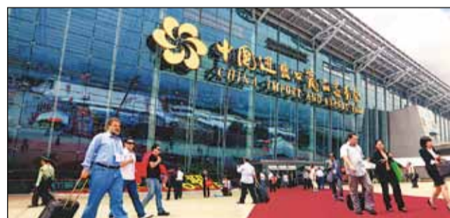
Canton Fair, a biannual trade event in Guangzhou, has established a reputation for promoting imports and exports.

COSCO's new company in Guangzhou, forming the world's largest bulk vessel fleet in terms of both ship numbers