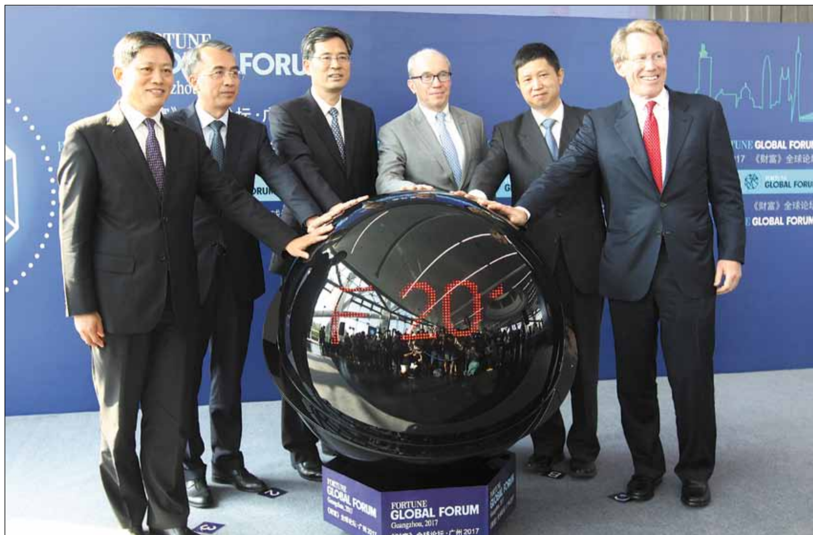
Government officials and their business partners mark the launch of the preparatory work for the Fortune Global Forum scheduled for next year in Guangzhou, Guangdong province.

They will help the city get easier access to premium